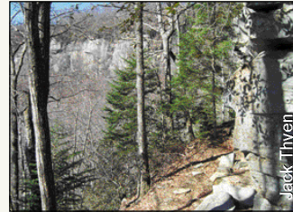
The Rainbow Falls Trail