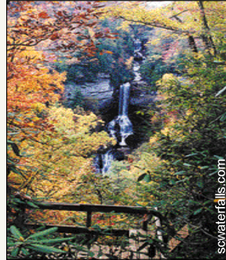
Raven Cliff Falls