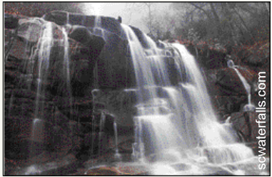
Fall Creek Falls