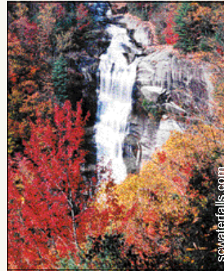
Lower Whitewater Falls