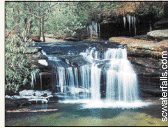
Carrick Creek Falls