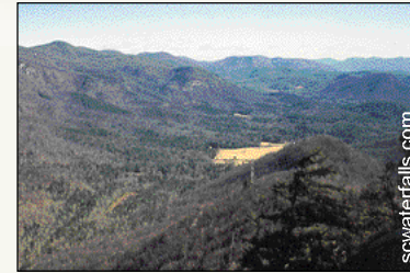
View from Little Pinnacle Mountain